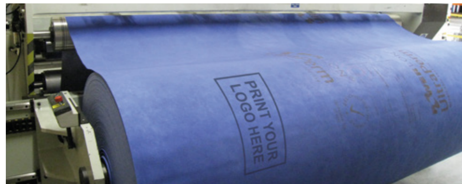
Powerlon UltraPerm can be customised to include your logo

Powerlon UltraPerm can be customised and printed for corporate branding, product identification and advertising. Powerlon SP100 (house-wrap) also custom printable.