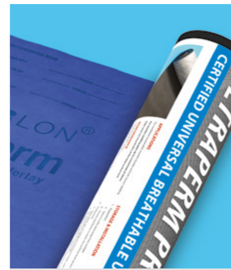
Comprehensive installation instructions with each roll