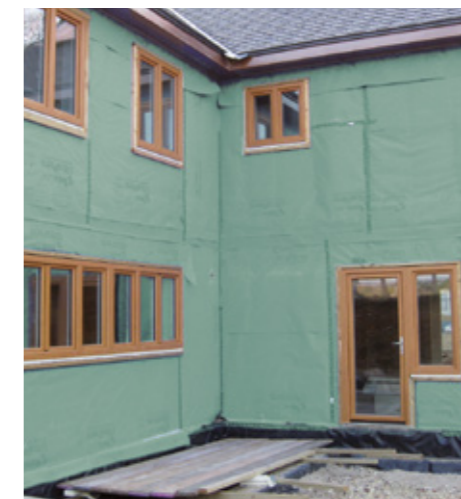
Powerlon UltraPerm is also certified for walls