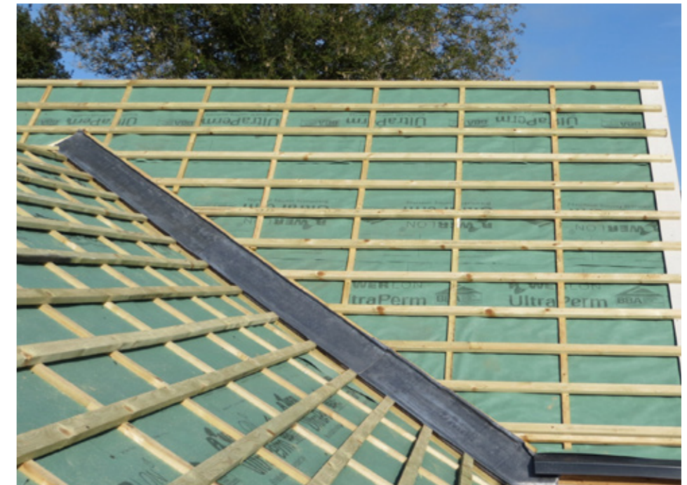
Powerlon UltraPerm is BBA Certified

UltraPerm is a non-woven composite membrane with and without integrated self-adhesive strips. With pre-printed marking lines for both roof pitch and overlaps for supported and un-supported roofs. Installation is quicker and easier. Within the Powerbond range of accessories there are additional penetration and jointing tapes available.