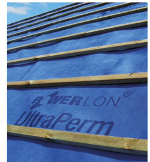
Powerlon UltraPerm for all roof types

Powerlon® is a Registered Trade Name of Industrial Textiles & Plastics Ltd. E&OE.